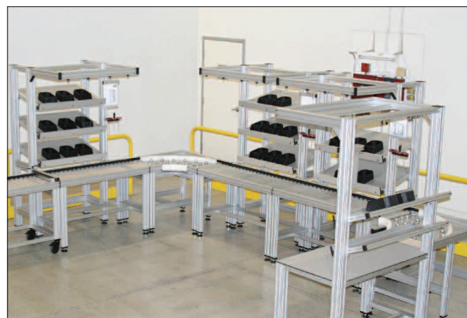
Hydraulic Pump Industry – Lean Assembly and Packaging Station