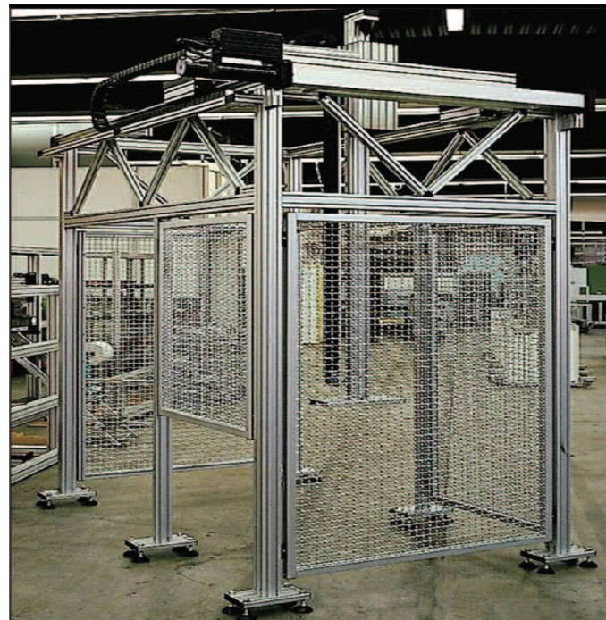
Electronics Industry – End of Line Packaging Robot

See how item can solve all of your packaging or material handling needs.