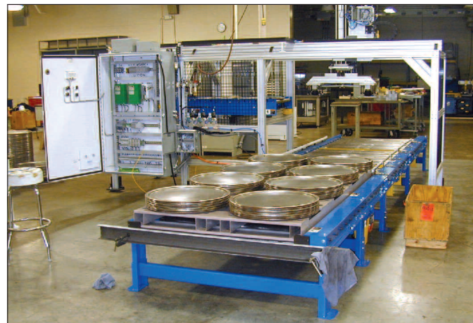
Petroleum Industry – 55 Gallon Drum Filling Station