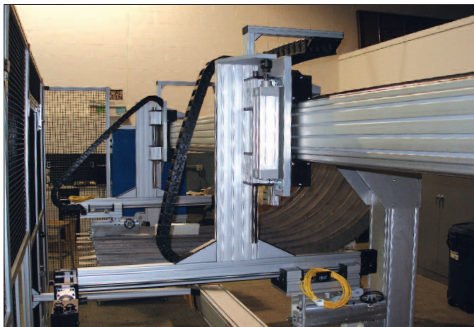
Food Service – Automated Tray Packaging Line